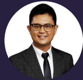
Adjunct Faculty Asian Institute of Management

To find out how you can participate, contact us at SEELL@aim.edu or visit https://go.aim.edu/seellinquiries https://go.aim.edu/seellprogramcalendar