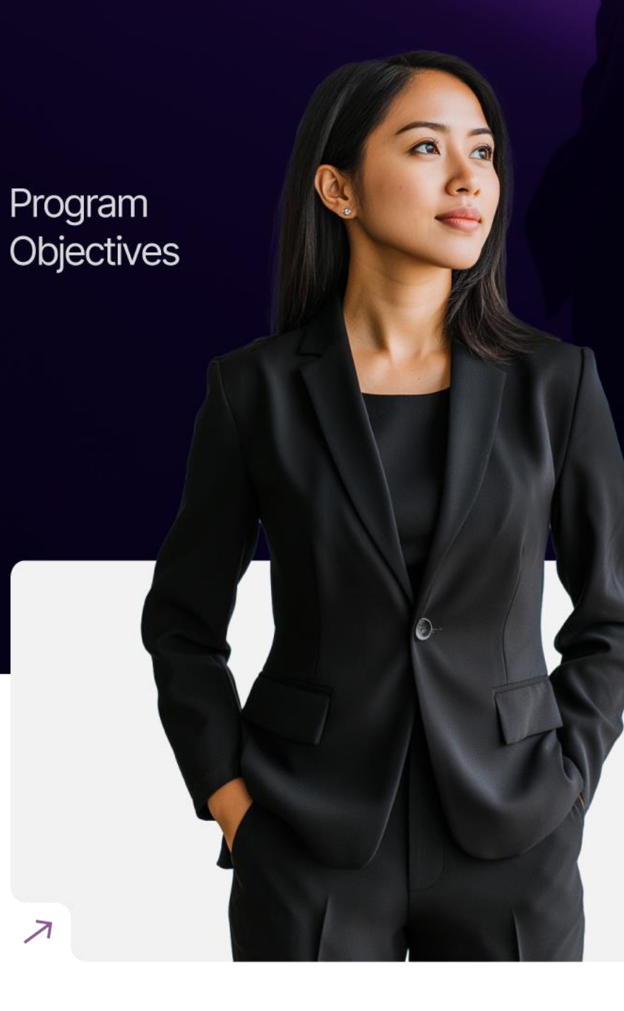
Chart your own course to professional development.

The executive programs at the Asian Institute of Management School of Executive Education and Lifelong Learning (AIM-SEELL) put you in control. Choose the focus areas that accelerate your career and cultivate the skills to drive success. With SEELL, you will experience: